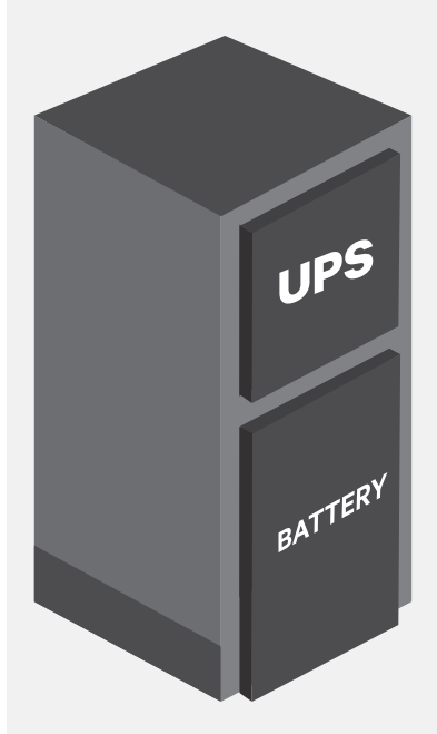
UPS with fully integrated battery