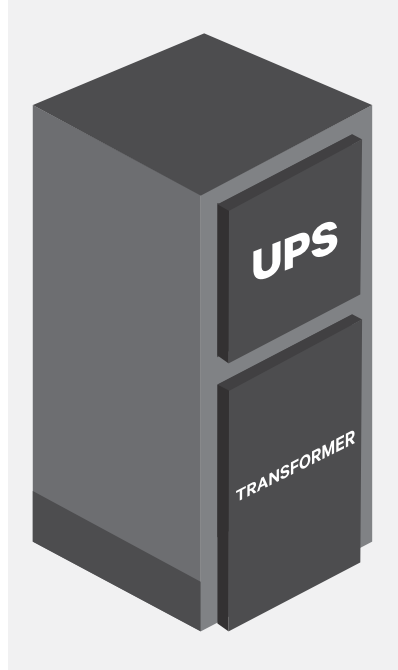
UPS with integrated isolation transformer